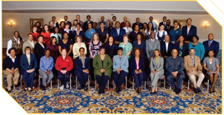
2008–2009 Board of Corporate Affiliates

Academic Pyramid of Excellence (APEX), formerly NSBE TorchBearer and Junior TorchBearer, was launched in 2008 to recognize pre-college and collegiate members who received between a 3.0 and 4.0 GPA. More than 1,400 students were recognized at the Annual Convention as APEX honorees.