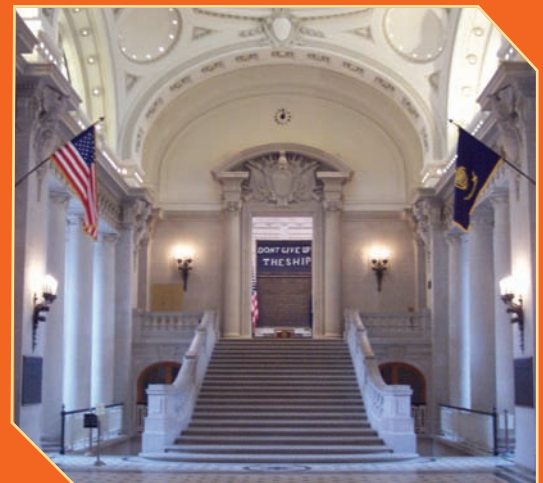
U.S. Naval Academy