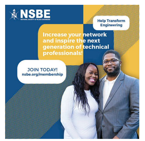
Twitter/Instagram: 1080 px x1080 px