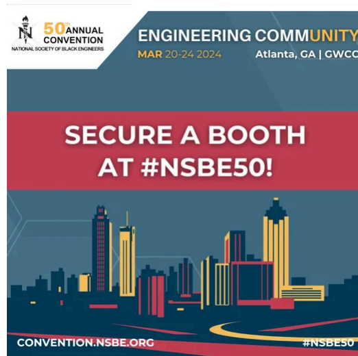
Exhibit at #NSBE50!

We invite you to join us at this landmark event to participate as an exhibitor at the NSBE 50th Annual Convention (#NSBE50) Career Fair. Our annual Career Fair is a much-anticipated, premier event where more than 15,000 of our members, and